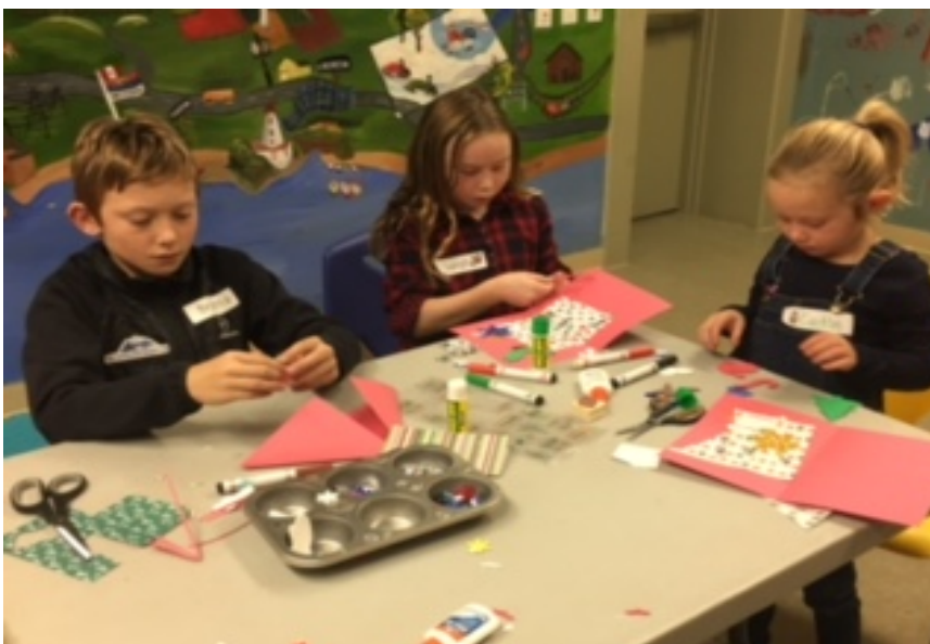
Children making holiday cards in 'Christmas Cards - Then and Now'

Preschool Christmas Fun on November 30 was a morning program for caregivers and their children aged 5 and under. The program featured fun holiday activities including cookie decorating.